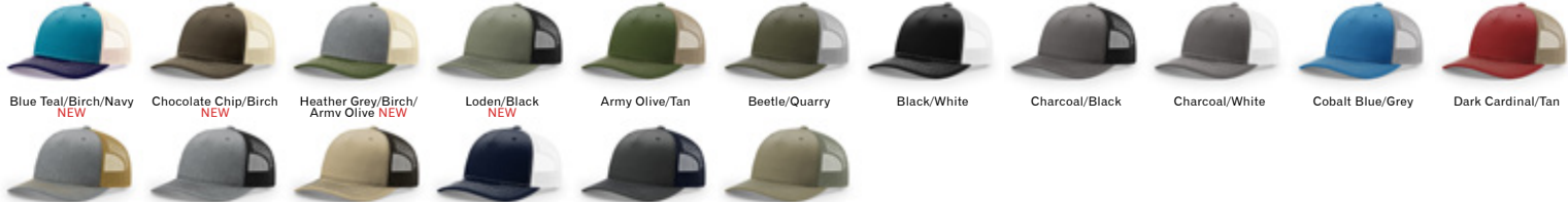
Blue Teal/Birch/Navy NEW

SPLIT COLORS: First color is crown front panels, eyelets, visor, undervisor, and button. Second color is crown back mesh panels, backstrap, and contrast stitching on front panels and visor.